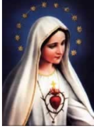
St. Mary, Mother of Christ Queen of the Knights